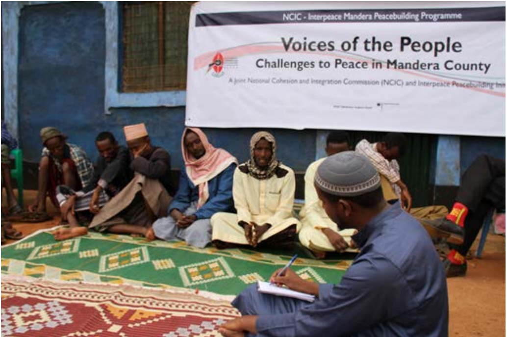
A programme researcher notes the views of respondents during the participatory research phase.