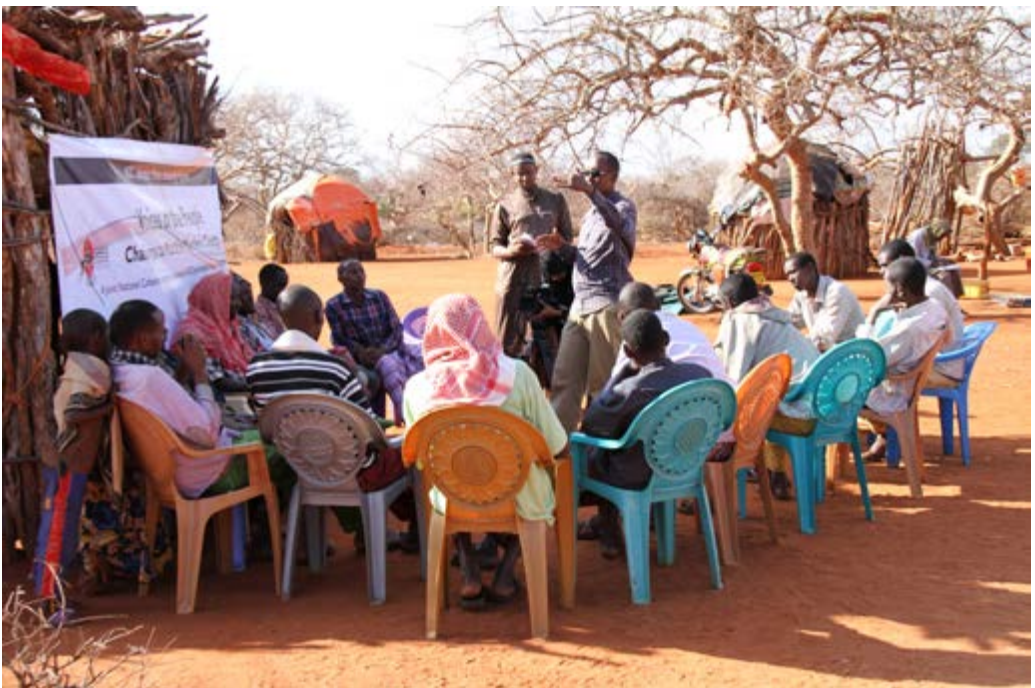
The silent majority speaks: The youth form the majority of the population in Mandera, but most decisions affecting them are made by older men.