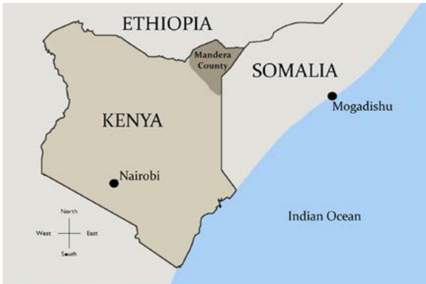
FIGURE 1: Location of Mander County in North Eastern Kenya