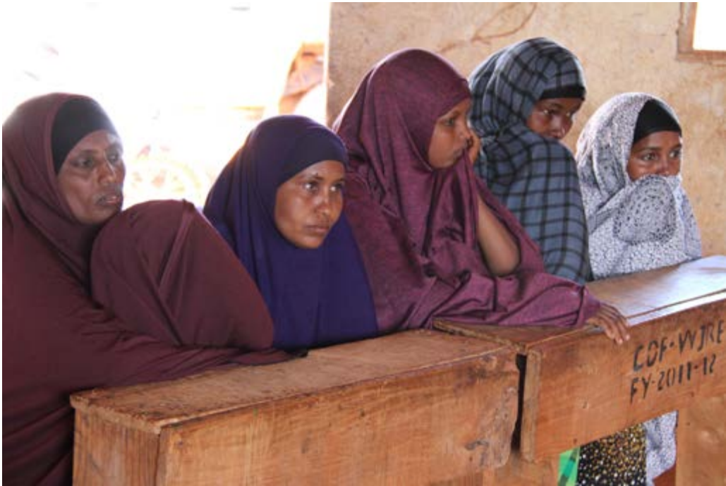
Seeking every voice: Participants at a women-only focus group discussion.