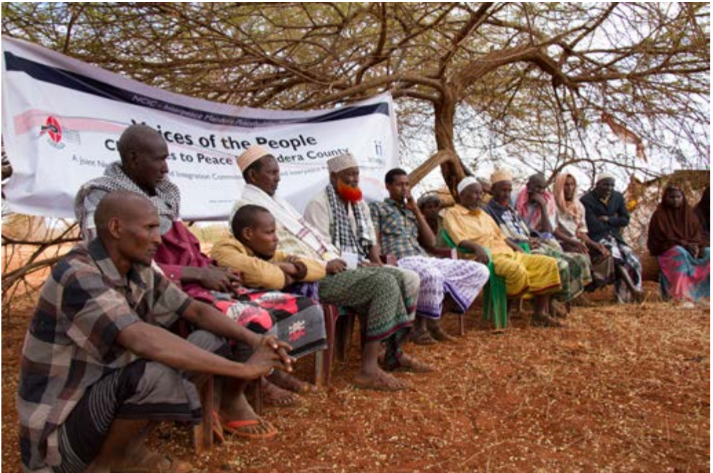
The perspective of the sages: The Ugas (clan elders) are among the most important players on peace and related issues in Mandera.