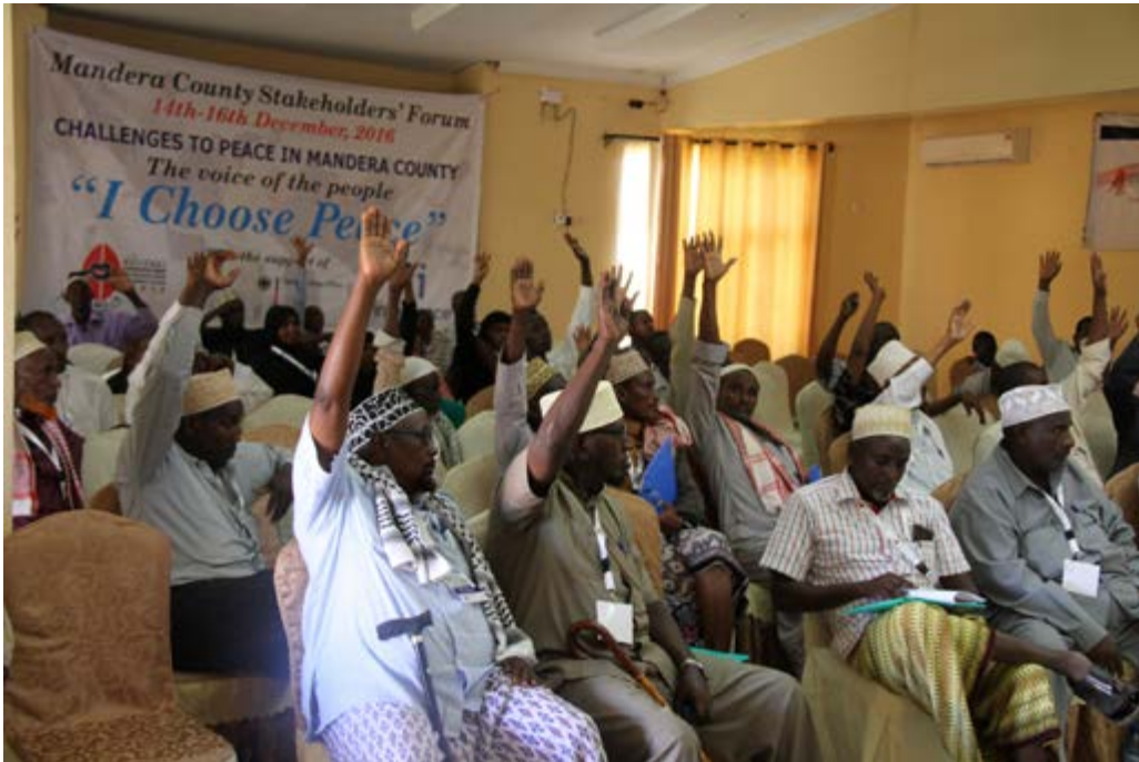
Seeking peace through consensus and dialogue: Participants at the stakeholders' forum vote on their priorities for peace in Mandera.