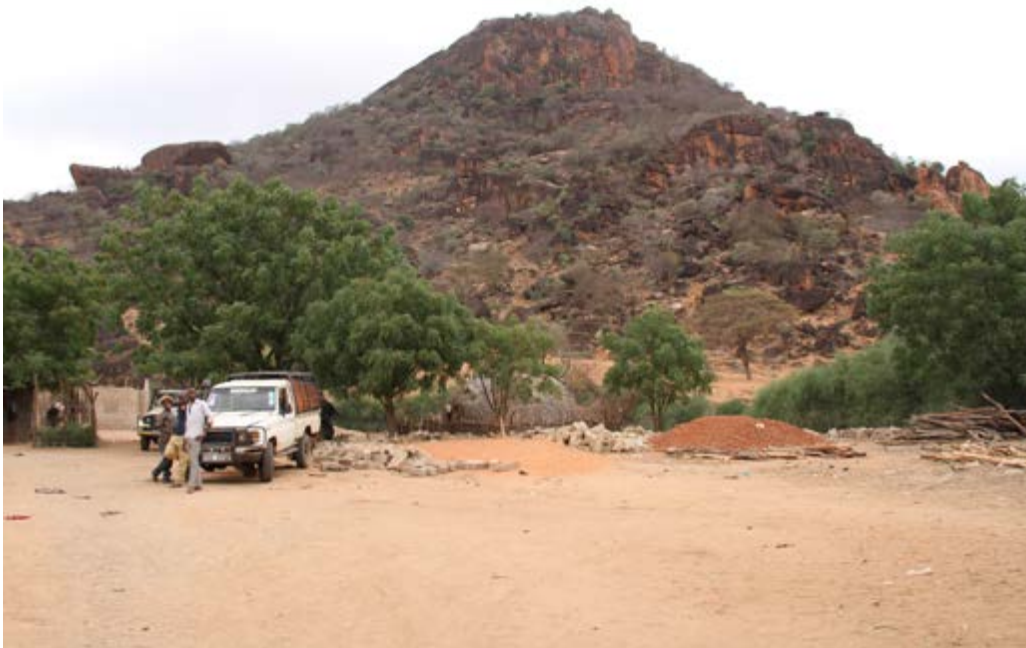
Dry and hilly, Mandera is part of the arid and semi-arid rangelands of northern Kenya.