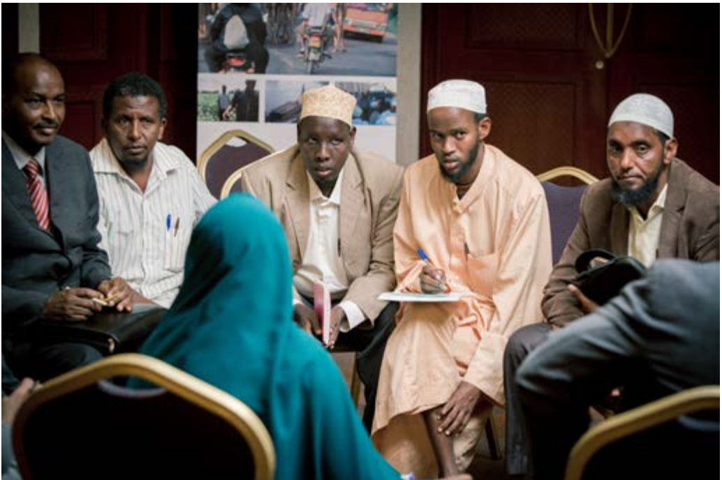
Participants at a cross-clan focus group discussion listen keenly as a respected community member expresses his opinion.