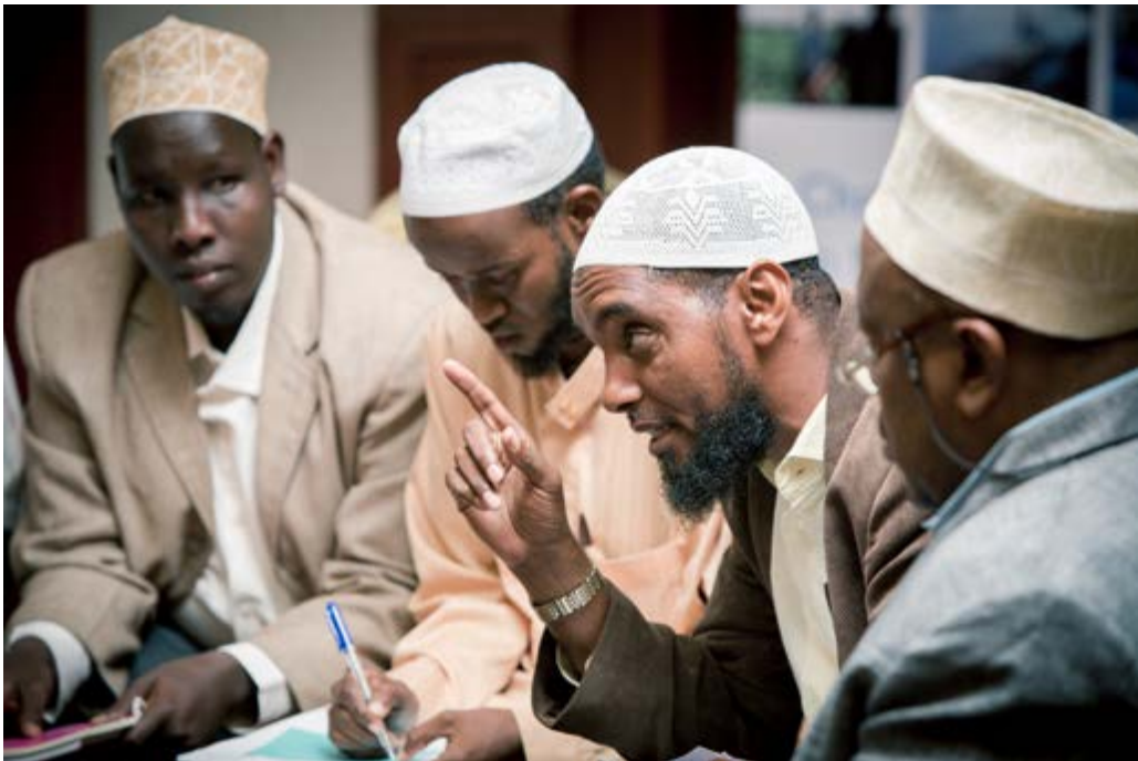
Addressing the issues head on: A man stresses a point at a mixed focus group discussion.